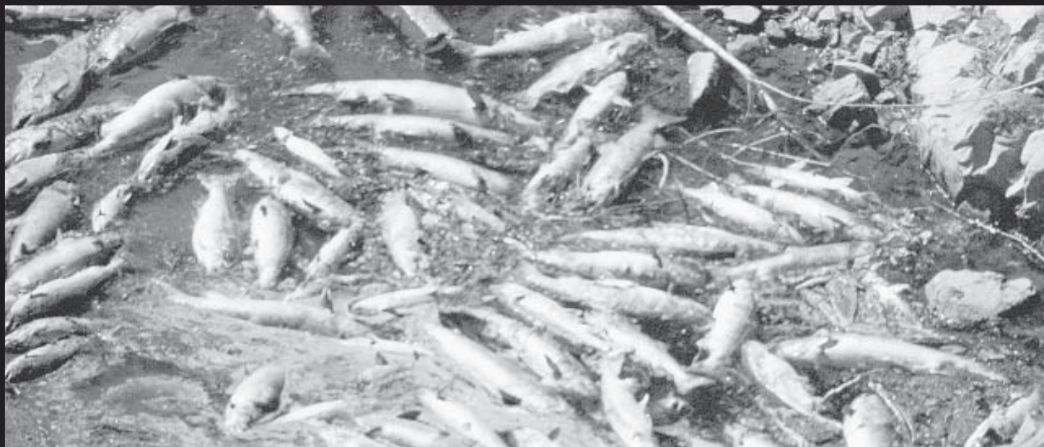
Klamath River salmon fish kill, 2002 – the worst fish kill in US history, caused by over-allocation of water to irrigation.